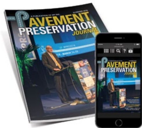
Pavement Preservation Journal print & digital magazine