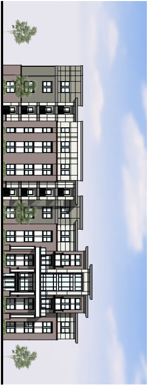
South Elevation (Virginia Beach Boulevard)