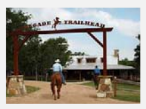
Horseback riding through Renegade Trailhead