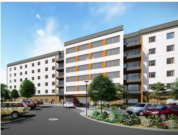
Lakeridge Gardens Long-Term Care Rapid build project completed in 2022