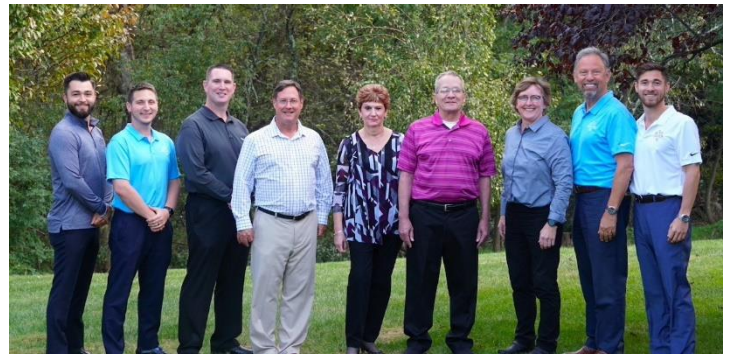
At the closing on September 30th were representatives from Hall's Pest Control, Plunkett's Pest Control, and The Aust Group.

The Aust Group represented Hall's Pest Control, Inc. as the exclusive financial advisor on the transaction. The transaction closed on September 30th, 2021 and the terms of this transaction were not disclosed.