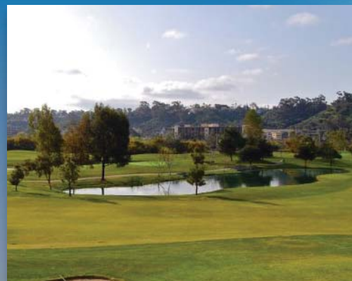
River is a prominent feature of the layout, contributing to the beauty and challenge of the course.

Riverwalk Golf Club 1150 Fashion Valley Road San Diego, CA 92108