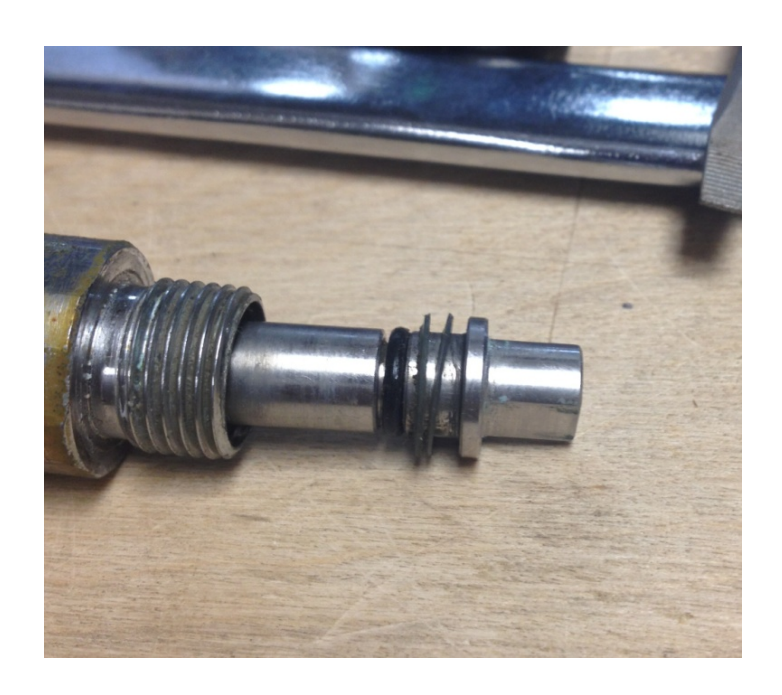
Extra washers on valve stem, valve not serviced