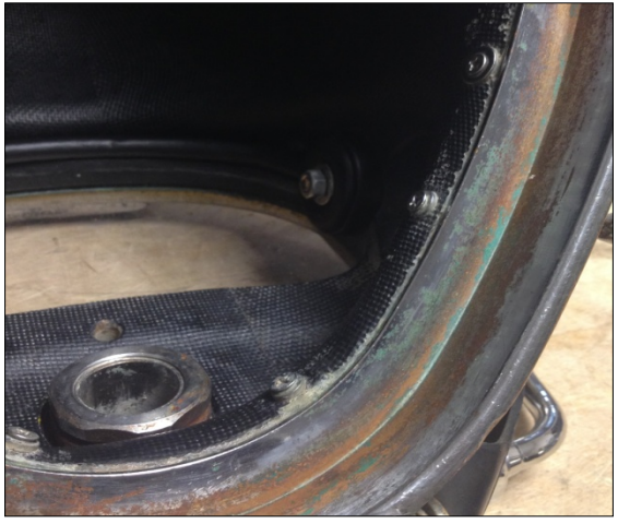
9 out of 10 head/chin cushion snaps broken or missing