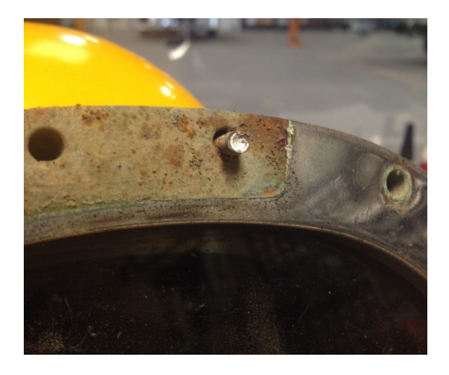
Several face-port screws seized; one had to be drilled for removal