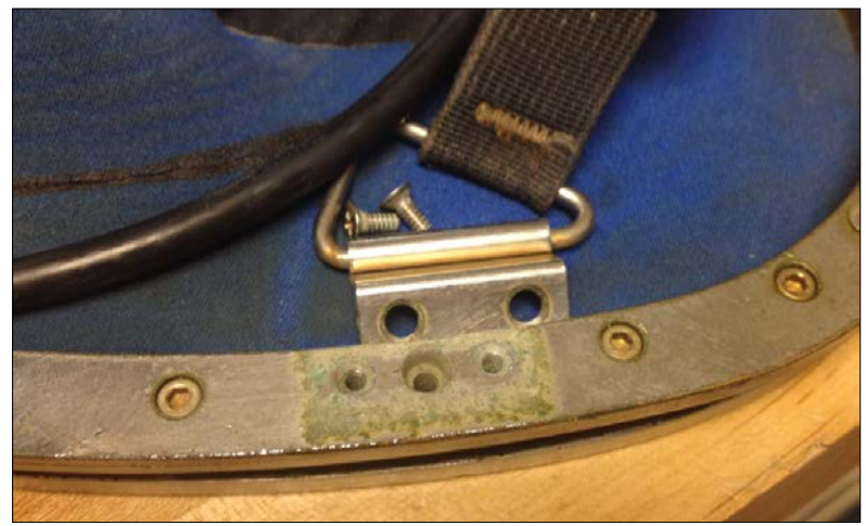
Neck ring screws missing from beneath chin strap retainers