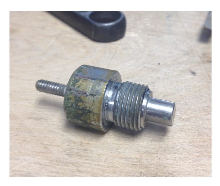
O-ring missing from steady-flow bonnet