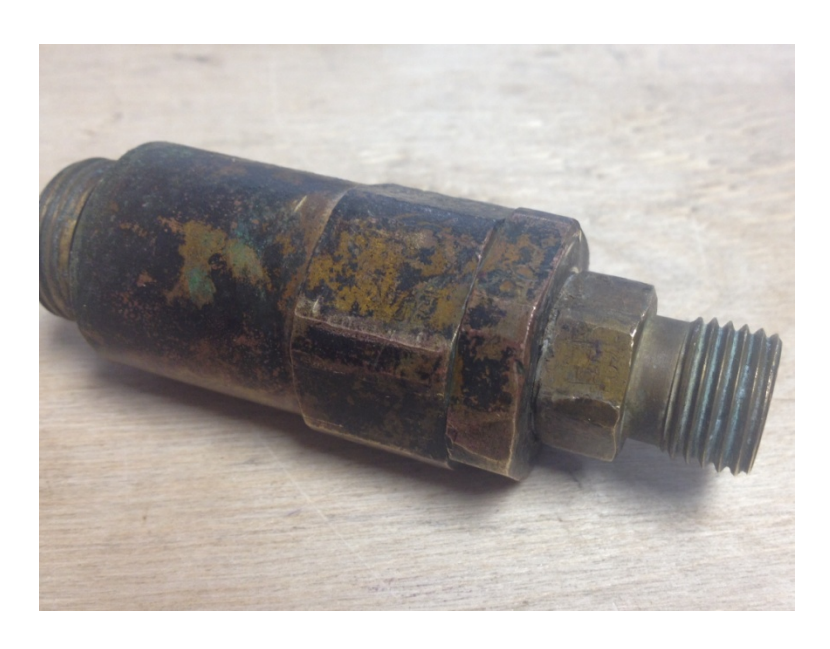
Umbilical adapter forced in too far; valve not serviced.