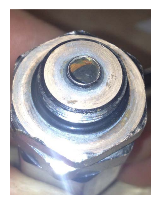
Damaged inlet knife-edge; does not seal properly