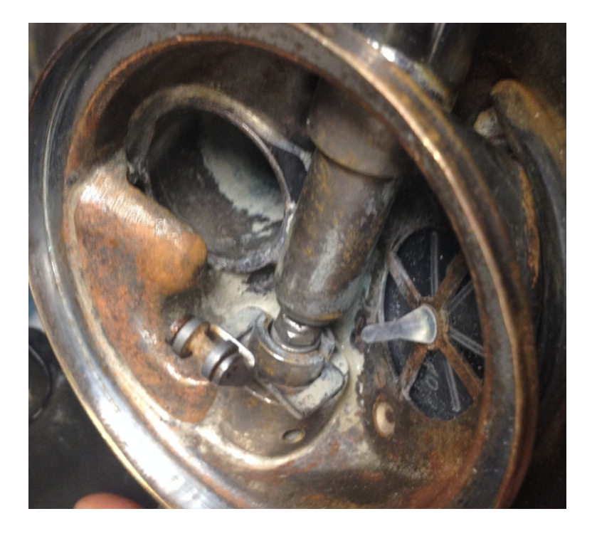
Mud in regulator, old nut, worn soft seat, and regulator not serviced