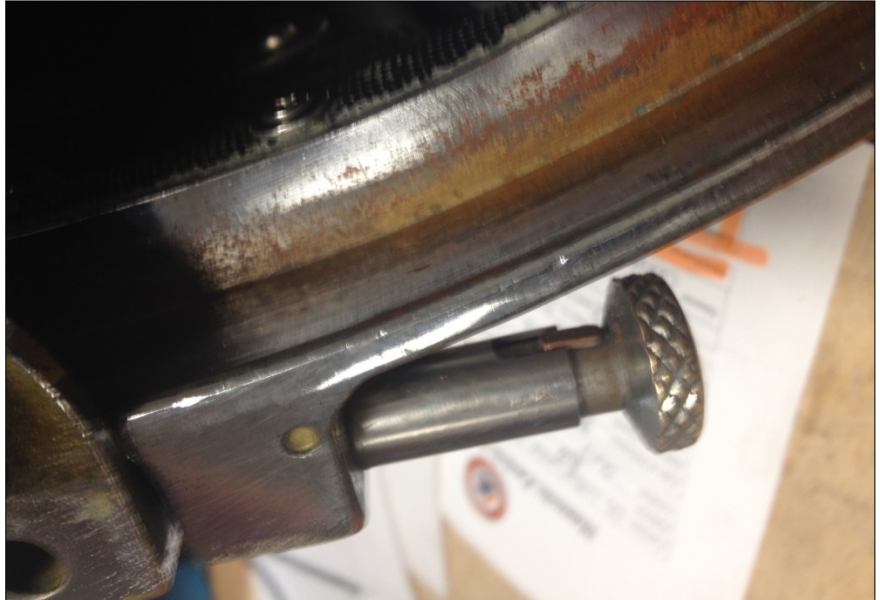
Both pull-pins sticking, and difficult to push or pull; in need of repair