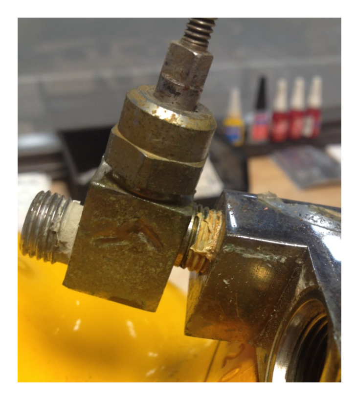
EGS valve body damaged, some sort of plumbers putty on connections