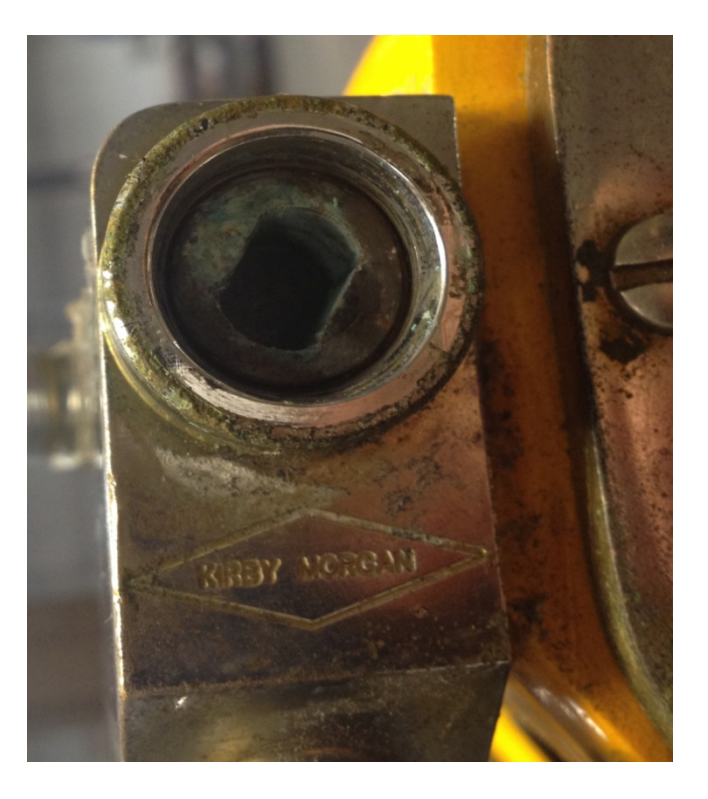
Mud and grit in the steady-flow valve, bonnet grinding in threads