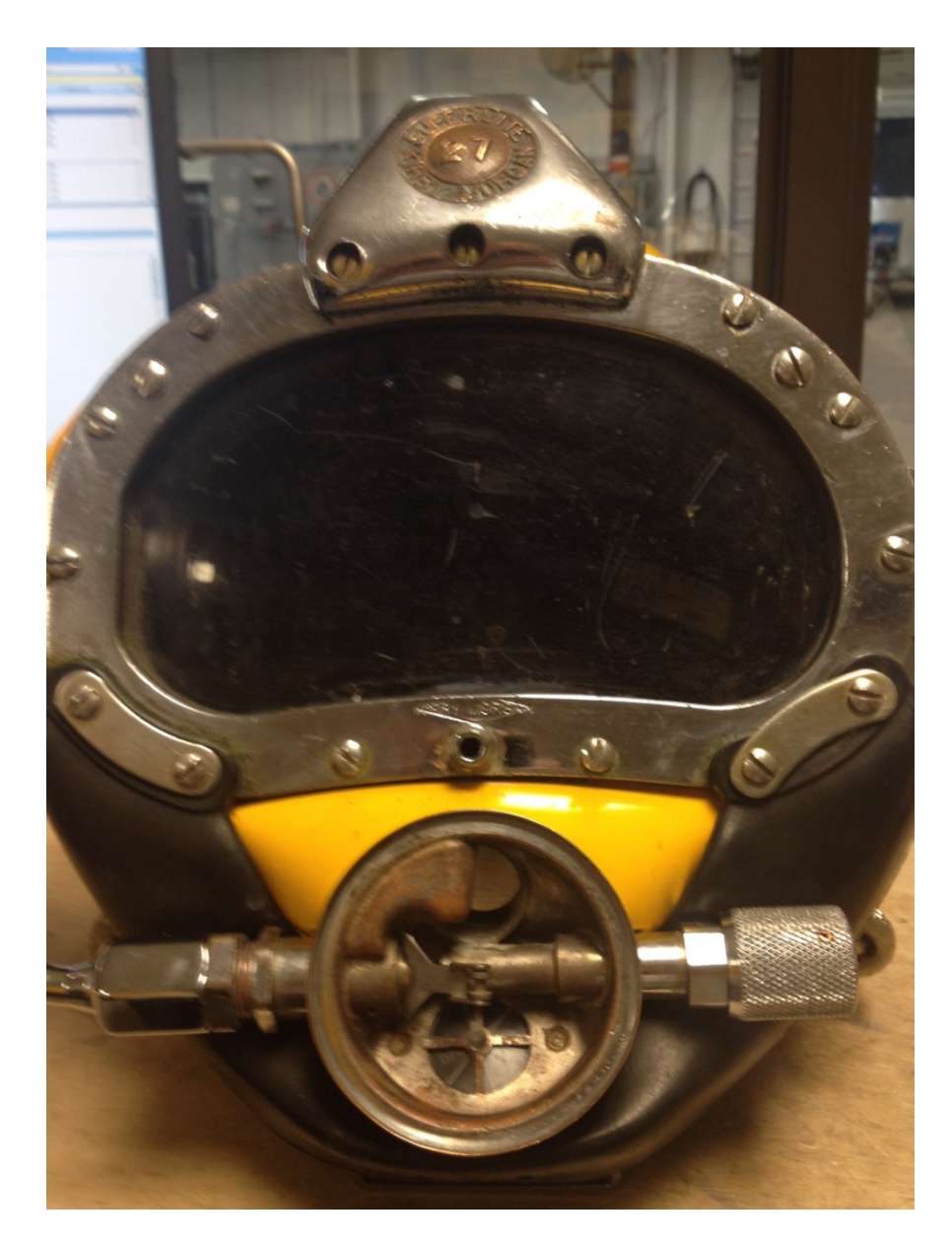
Kidney plate inverted