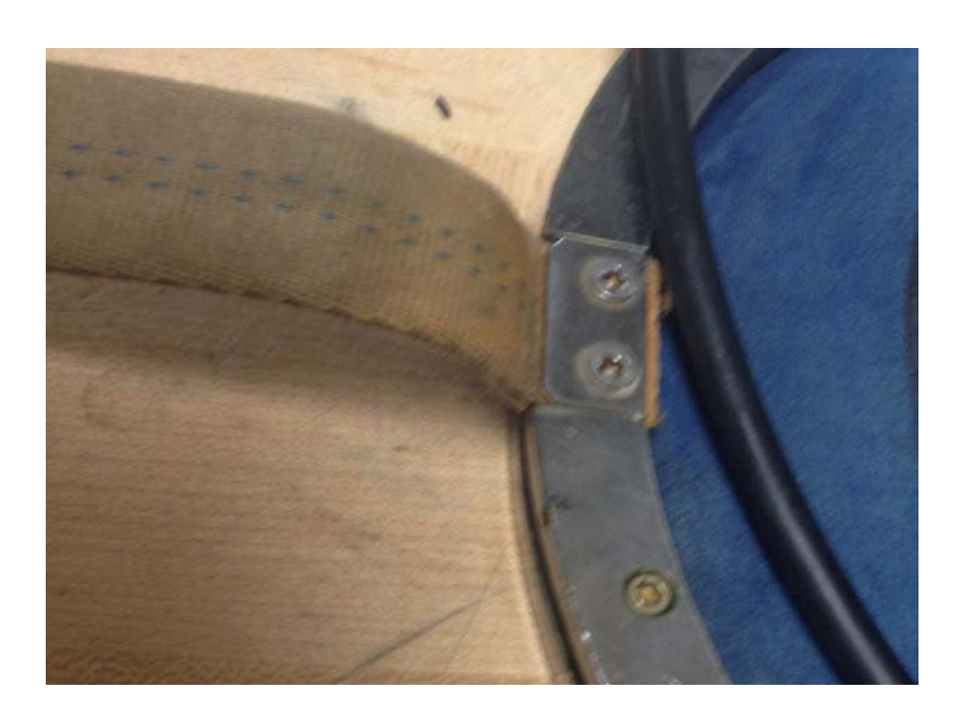
Neck strap inverted