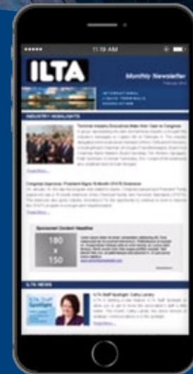
ILTA MONTHLY NEWSLETTER