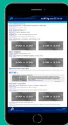
EPIPELINE monthly eNewsletter