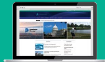
OGA WEBSITE www.ohiogasassoc.org