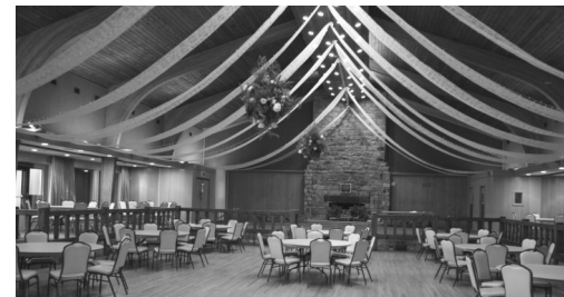
Exhibit Hall at Oglebay Resort