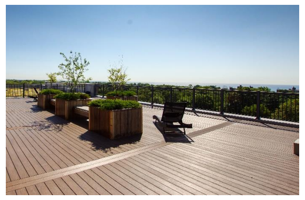
TruNorth Deck 1