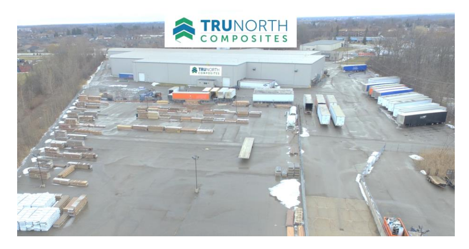
Manufacturing and Distribution Facility