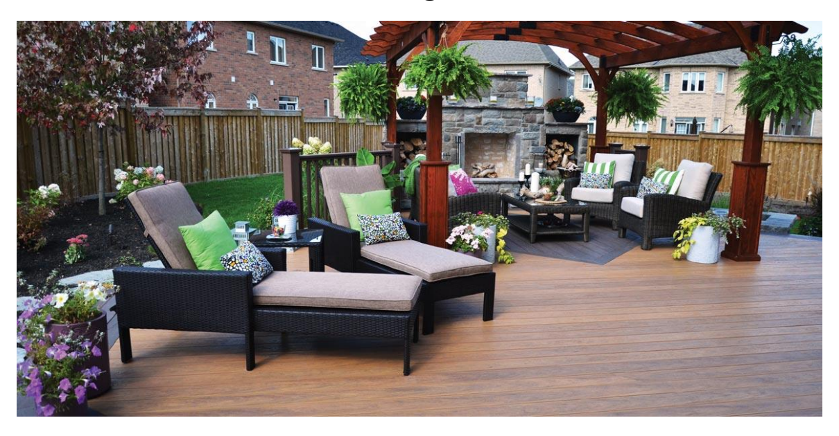
Clubhouse Decking 1