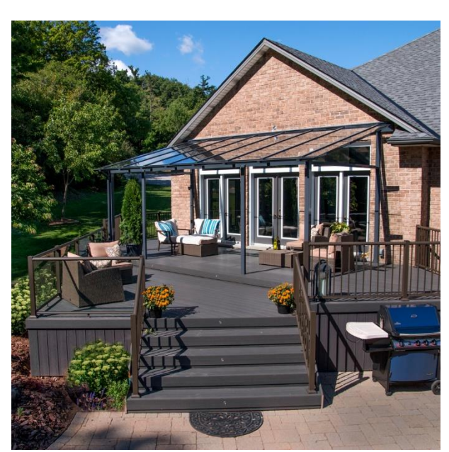
Clubhouse Decking 2