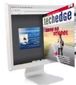
TechEdge magazine digital edition

This issue features bonus distribution at the 2012 TCEA Convention and Expo!