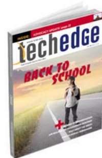
TechEdge magazine print edition

Connecting you with TCEA members throughout the year!