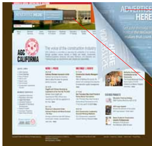
Home Page Sample