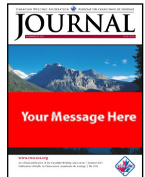
Sample Belly Band

You can also ensure your message is the first readers see by wrapping it around the Canadian Welding Association Journal with a belly band. Since readers must detach the belly band to access the rest of the publication, your full-colour ad is ideally placed to be noticed. This is an exclusive advertising opportunity, as only one belly band will be sold per issue.