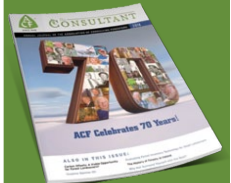
The Consultant Magazine