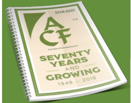
Membership Directory & Resource Guide

Contact your Naylor account executive today to reach the nation's most trusted forestry professionals!