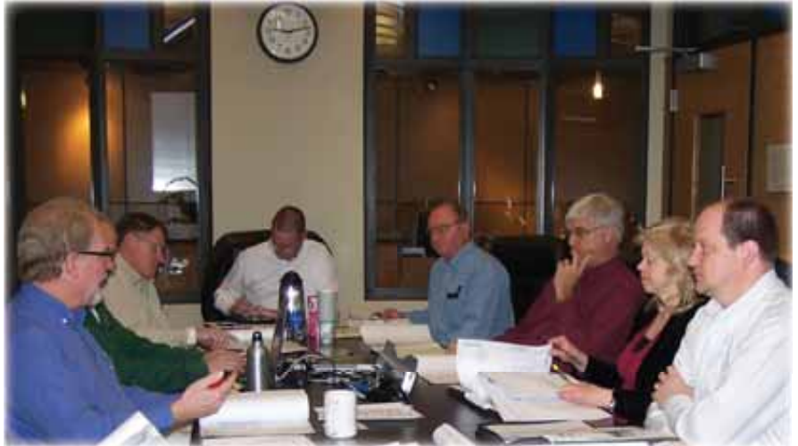
Regular communication between district personnel and their construction manager can help ensure a safe and successful construction project.