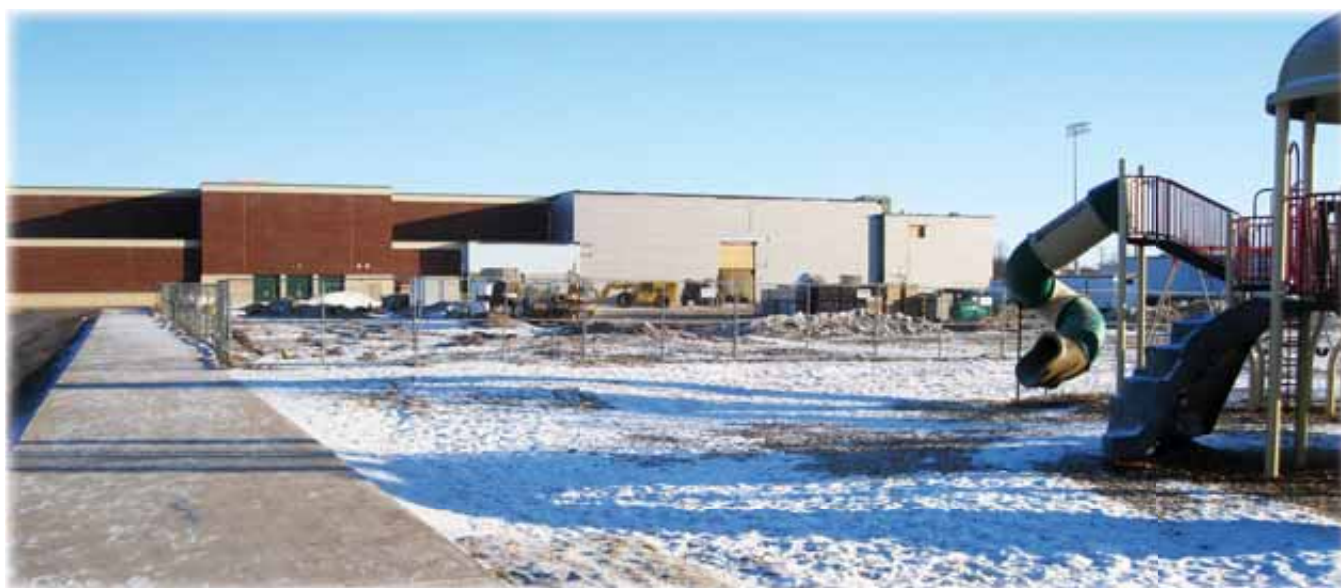
Setting up areas of construction that are fenced off, secure, and only accessible by trained construction personnel is a critical component of any safety management plan.

If the project is small enough, most activities can be scheduled to take place during the summer—when the school is less occupied and access and hours of work can be expanded to accommodate subcontractors. If this isn't possible, it's important to minimize those times when subcontractors need access to the building and