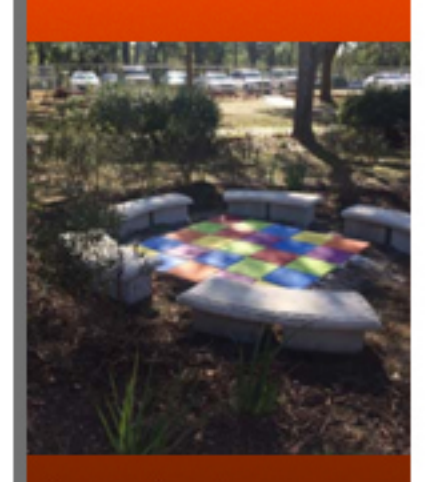
An outdoor classroom detail featuring the painted pavers and concrete benches

SCASLA members enjoying a hike at the Hawthorne Trail in Gainesville