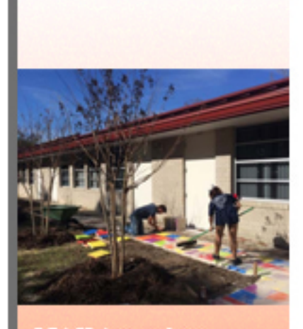
SCASLA members almost finished at Irby, polishing up the pavers