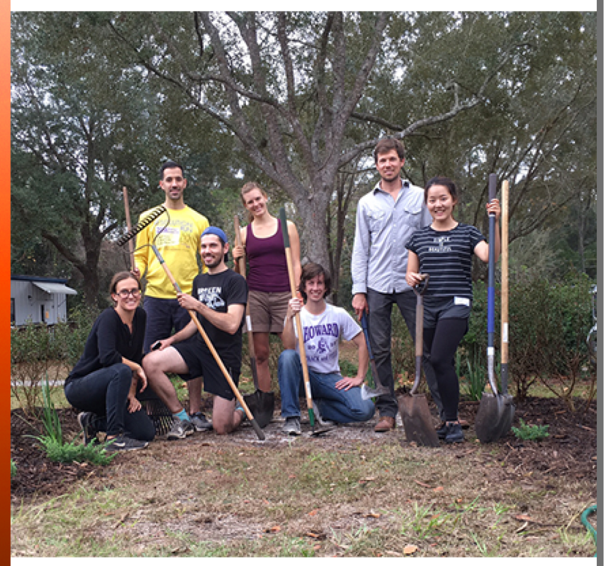
Pictured are SCASLA members posing after a hardworking day at Irby spent planting, painting, and placing.