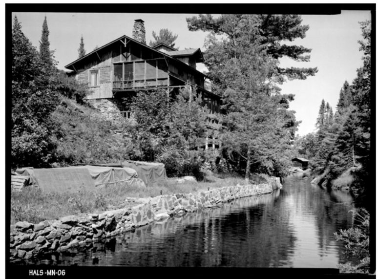
MAIN HOUSE LARGE FORMAT PHOTOGRAPHY BILL LUTRICK, ASLA