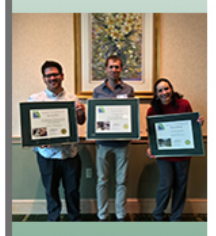
ASLA members receiving awards for Park(ing) Day

Seeing the sights with fellow student representatives from Minnesota and California.