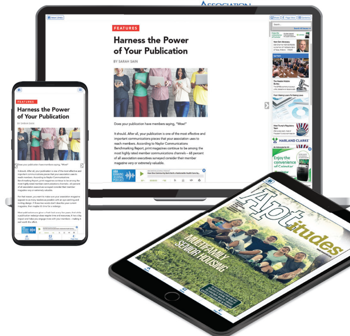
Mobile & Desktop Responsive HTML Reading View

Important Note: Readers can choose the experience best suited to their needs at any time by clicking on "Page View" or "Reading View" in the toolbar.